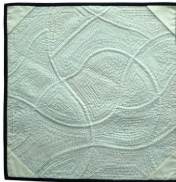
View of back of artwork