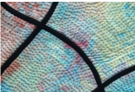
Detail image of artwork

The detail image of the back of the artwork as well as the close-up image shows the extensive stitching at its best along with the flow of thread colors across the textile. This artwork is designed to be displayed in either a vertical or horizontal orientation which allows for versatility in displaying the artwork spatially and visually.